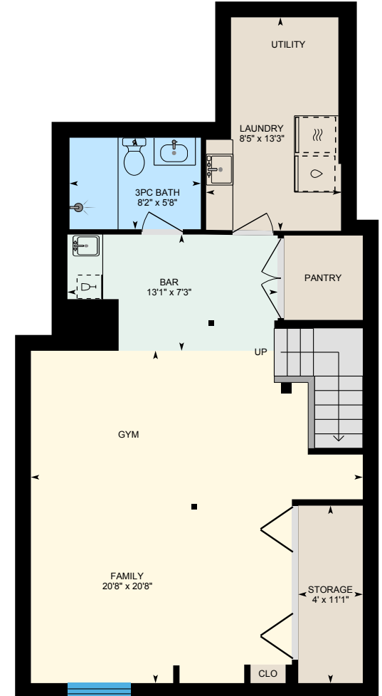
Basement (Below Grade) Exterior Area 838.02 sq ft